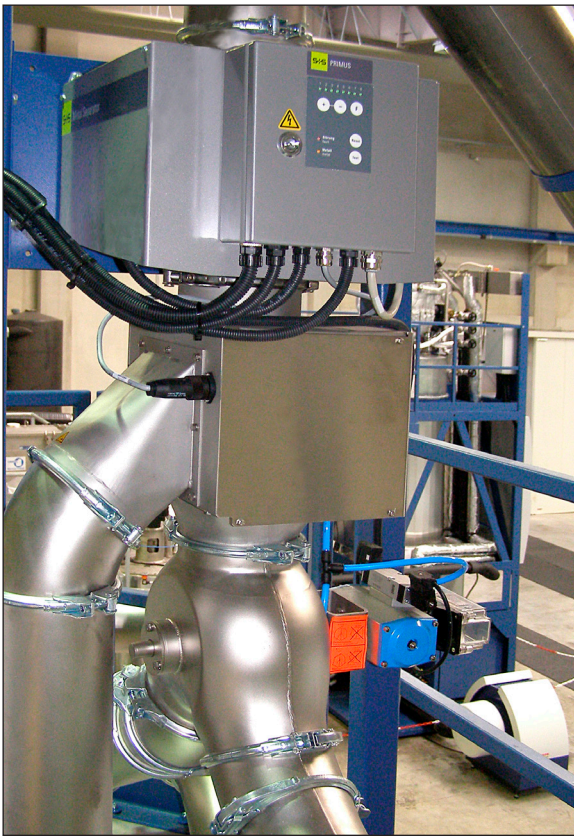
Installation example: Metal separator RAPID VARIO-FS used for the quality control of PET regenerate. (old version)